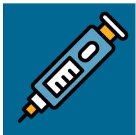
Thinksulin app icon